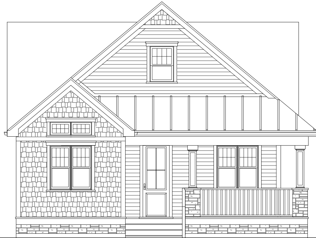
FRONT ELEVATION LOT 1A